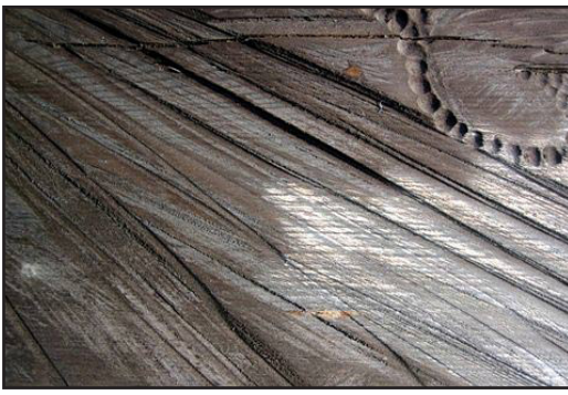
Wood that has been "pickled"

The stain created by the pickling solution will sit mostly on the wood's surface. To create interesting color variations, lightly sand your work after pickling to cut through the stain; then reapply a different solution concentration to the newly exposed wood. With the wood-pickling technique, you are limited only by your imagination and the amount of tea you can brew.