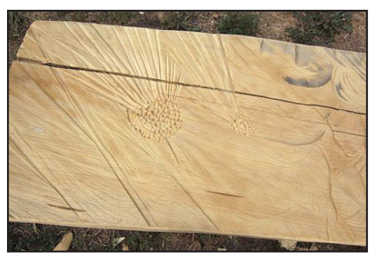
The untreated wood

Woodworking Newsletter Vol. 7, Issue 4 - March 2013