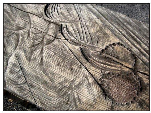
Various gradients of gray

The stain created by the pickling solution will sit mostly on the wood's surface. To create interesting color variations, lightly sand your work after pickling to cut through the stain; then reapply a different solution concentration to the newly exposed wood. With the wood-pickling technique, you are limited only by your imagination and the amount of tea you can brew.