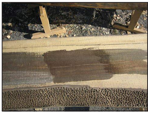
Use a sample board to test the color produced by various dilutions of the pickling mixture.

In a plastic container, dilute the solution by adding an equal amount of distilled water. Apply this to the wood with a foam brush to avoid contact with metal. Wear old clothes, as the pickling mixture will permanently stain cloth. Coat a small area of the sample board with the diluted mixture and label it. In another container, further dilute the solution. Apply this weaker mixture to another area and again label it. Wash your brush carefully between applications to avoid contamination. Continue along the board until you have a variety of test dilutions. The solution will go on clear and take an hour or so to produce the final color. It may darken